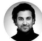
Salomon AIACH EARLYBIRD VENTURE CAPITAL